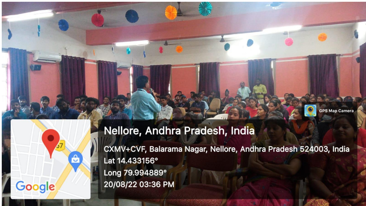
Student's interaction with resource person (Regarding IPR)