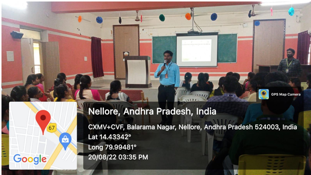
Resource person explaining about the different topics in Startups