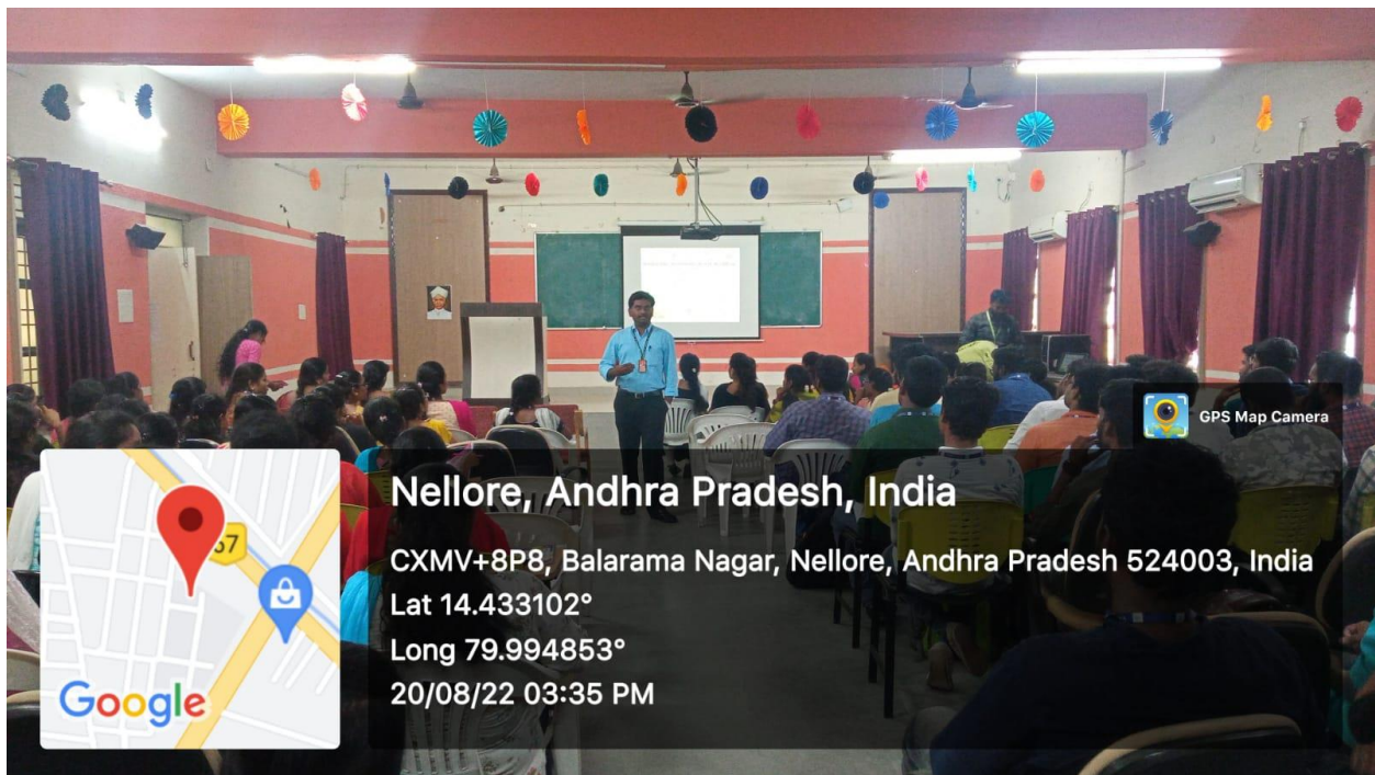
Resource person delivering information how to become an entrepreneur